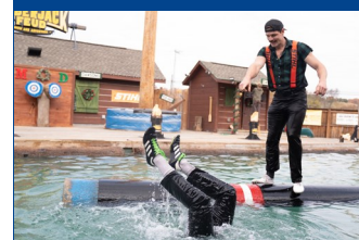
PAULA DEEN'S LUMBERJACK FEUD SHOW

Departure: Negaunee Senior Center, 410 Jackson St, Negaunee, MI @ 8 am