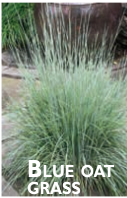
BLUE OAT GRASS