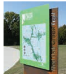
KIOSK, INTERPRETIVE SIGNAGE + ENTRANCE SIGN