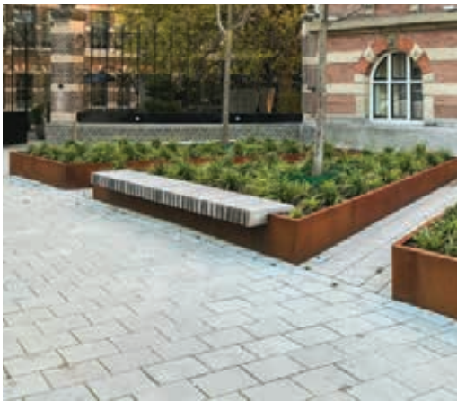
PLANTER WALL WITH BUILT IN BENCH