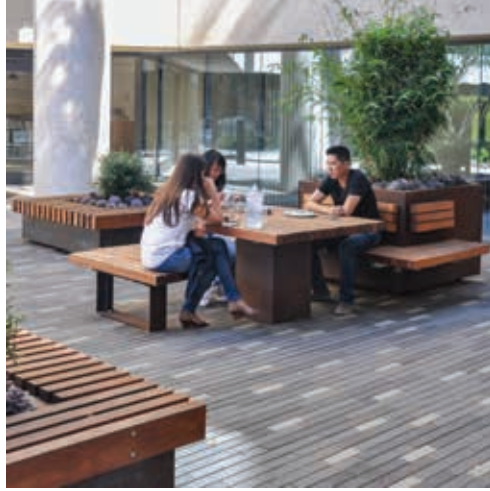
EXAMPLE PAVER SURFACE