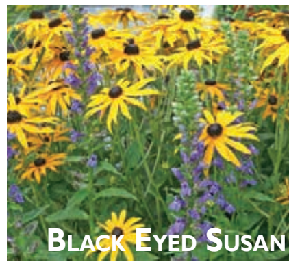
BLACK EYED SUSAN