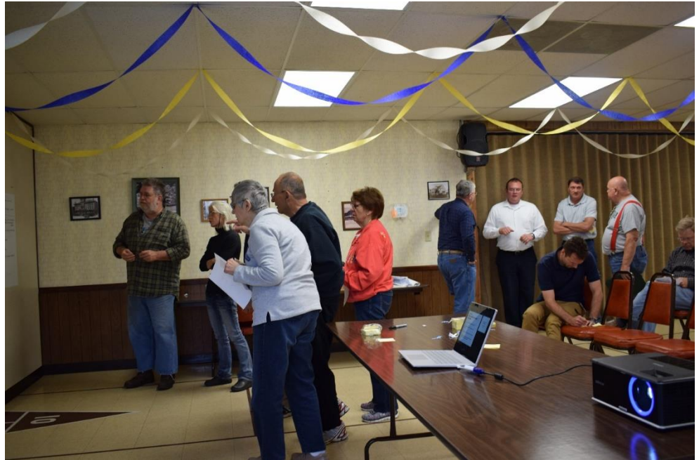
Negaunee Residents Engaging in a CIP public input activity

Part two of the public input session asked residents to identify potential projects of interest on Post-It notes and place them under broad pre-identified categories, like Roads and Sidewalks, Public Buildings, and Parks and Recreation. The results of these sticky notes were considered as city department heads worked on the submission of individual project submission forms.