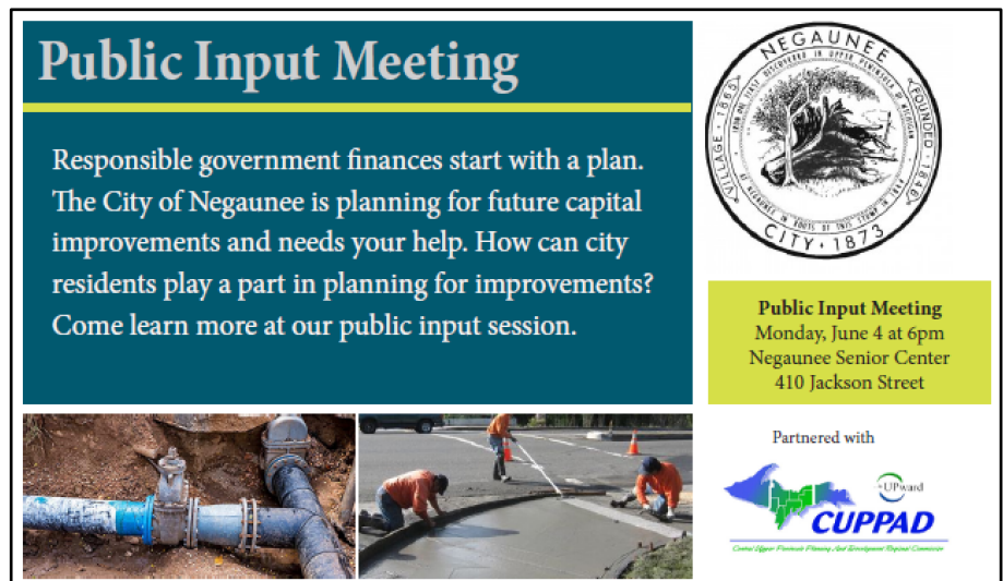
Postcard Invitation for the June 4th Public Input Meeting

Negaunee's capital improvements process also includes opportunities for public involvement prior to adoption of the CIP. On June 4 th , 2018, the City held a public information and input session on capital improvements to share project details and determine what kinds of improvements were most desirable to the public. A postcard invitation was mailed directly to all local residents in the City of Negaunee more than a week prior to the input meeting and reached approximately 1,700 households. The event was attended by approximately 32 residents from various neighborhoods across the City and their contributions